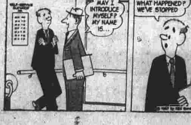
THE STORY OF MARTHA WAYNE

WHY DID YOU LET ME DO THAT? YOU DIDN'T TELL ME YOU WERE GOING TO DO THAT.