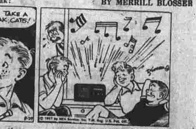
BY MERRILL BLOSSER