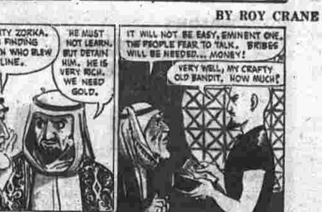
BY ROY CRANE