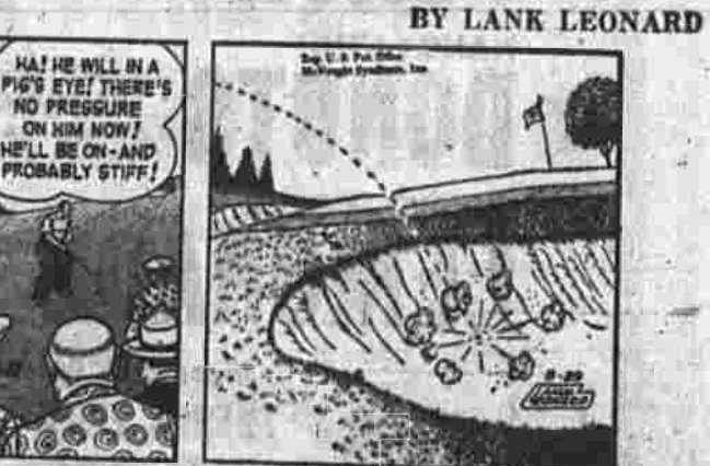
THAT'S A BREAK?